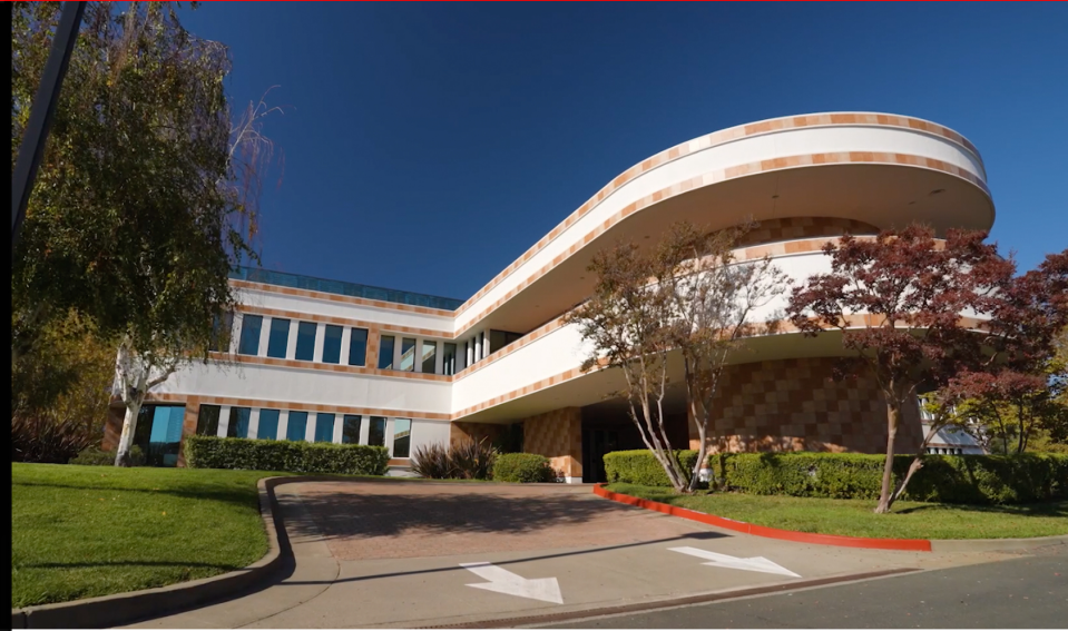
Solano Innovation Center 220 Campus Lane Fairfield, CA 94534